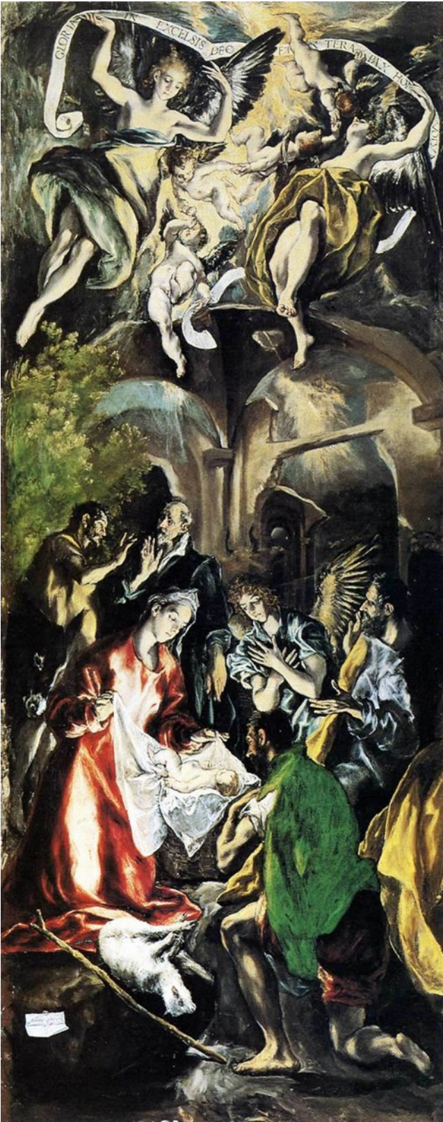
The Adoration of the Shepherds El Greco, 1596.

St. Andrew's Episcopal Church & School Houston, Texas